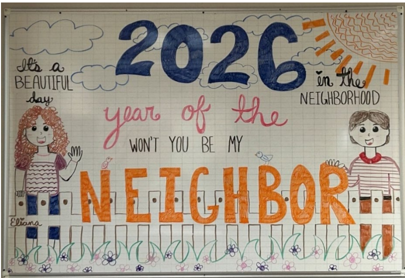
Photo of hand drawn "Year of the Neighbor" display, located in the DCF's Secretary's Office.

Governor Tony Evers declared 2026 the year of the Neighbor during his final State of the State address. As he explained, doing so highlights the importance of celebrating neighbors who make Wisconsin great, from first responders to farmers to veterans. This also includes our child welfare professionals, services providers, and families! It is critical for DCF and other agencies to create a network of support for professionals, partners, families, and young adults. Doing so will strengthen communities, support the workforce, and create opportunities for young people now and into the future. Thank you all for the work you do every day serving WI youth.