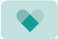
Quality Case Planning