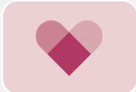
Initial Assessment Improvement Project

Four projects focused on supporting the workforce and centering children, youth, and families.