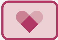
Initial Assessment Improvement Project

Four projects focused on supporting the workforce and centering children, youth, and families.