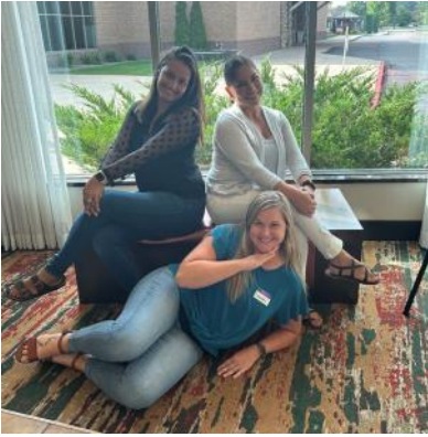
Figure 1 Lincoln and Outagamie Coaches

BYS is excited to share photos from the 1st annual YASI Coach Celebration and Networking Event held in Stevens Point in August. Cohort 1 and 2 county coaches met in-person for skill-building, networking, and fun. YASI Coach Cohort 3 began training in September.