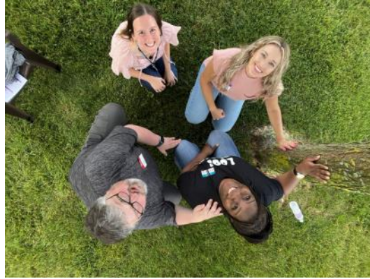
Figure 2 Marathon, La Crosse, Racine, and Dunn Coaches