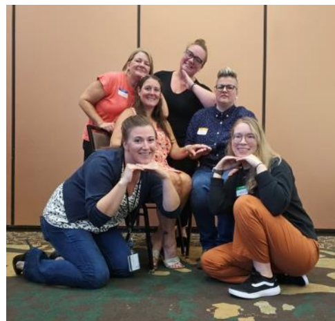
Figure 7 PDS, BYS Awkward Throwback Family Photo