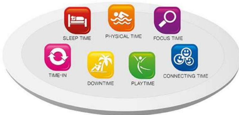
The Healthy Mind Platter for Optimal Brain Matter