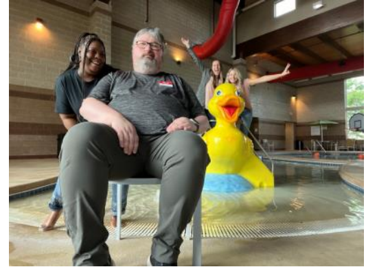
Figure 3 Racine, La Crosse, Marathon, and Dunn Coaches