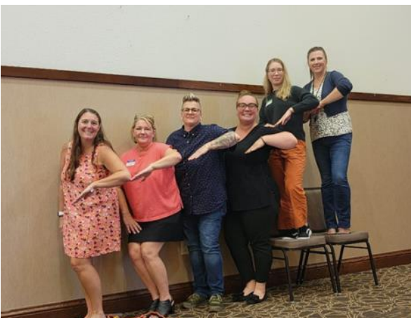
Figure 6 PDS, BYS Family Photo