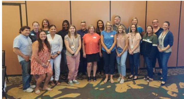
Figure 5 Cohort 1 and 2, PDS and BYS