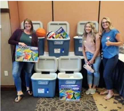
Figure 4 Coach Trivia Winners - Kenosha, Dunn, and Dane Coaches