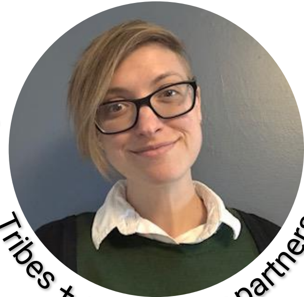
Tribes + community partners