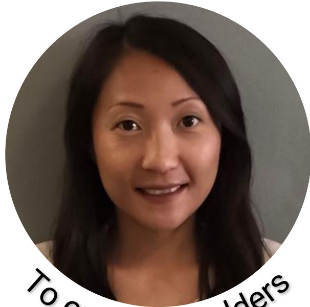
To our stakeholders