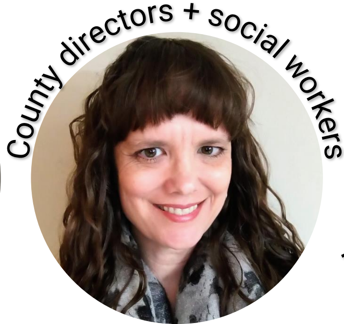
County directors + social workers