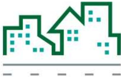
RESTORE MAIN STREET