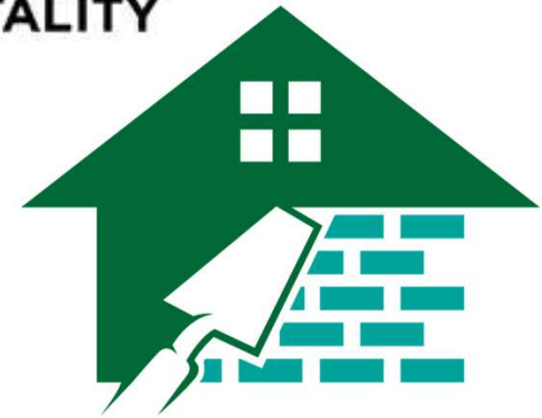
HOME REPAIR & REHAB